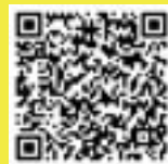
App Store code