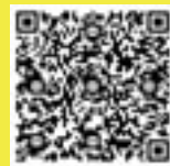
Google Play code